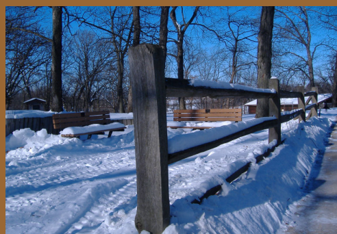
Camp Menno Haven at last years winter retreat.

Next Sunday, January 10th 6:00pm Meet at the youth house for game night. Bring your favorite board game.