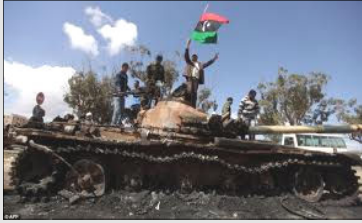
People stand on an abandoned tank in Libya